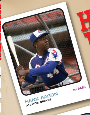
HANK AARON ATLANTA BRAVES 1st BASE